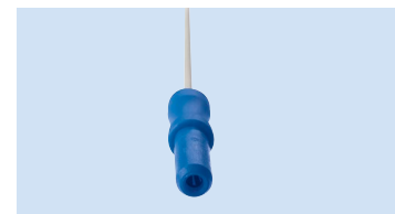
J = 2 mm connector