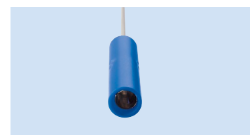
A = 4 mm connector