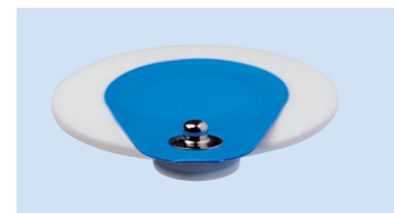
S = Stud