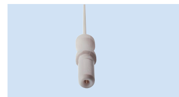
K = 1.5 mm connector