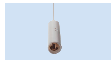
F = 3 mm connector