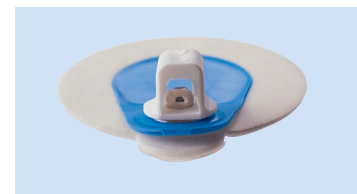
F = 3 mm connector