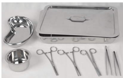
• 26963 DRESSING SET - 8 PIECES