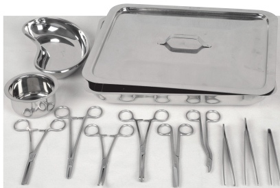
• 26965 SUTURE SET - 12 PIECES