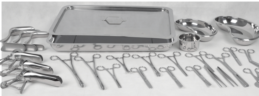
• 26966 MINOR DELIVERY SET - 25 PIECES