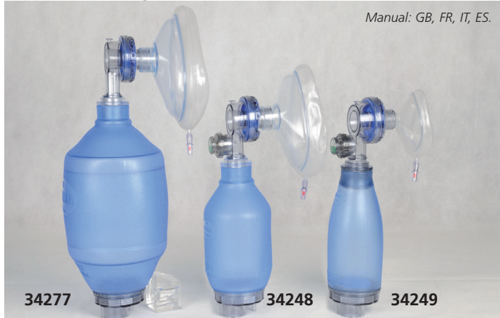
Manual: GB, FR, IT, ES.