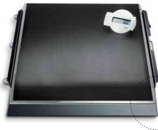
A ramp for easy roll-on of wheelchair is included in delivery.