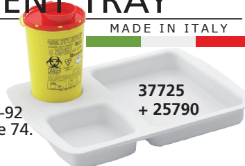
37725 + 25790

35x24,5xh 4,4 cm - box of 24 Compartment tray suitable for carrying small containers and minor hospital waste. Tray fits PBS containers 25790-91-92 and CS container 25782, see page 74.