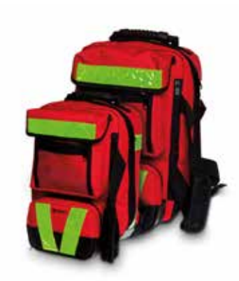
ARKY Compact and Large AED backpack