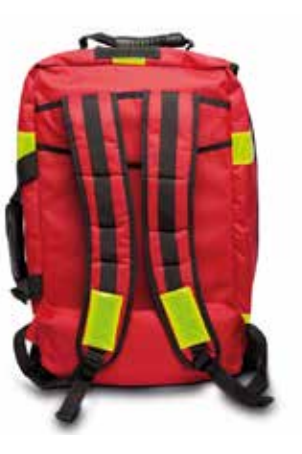
ARKY AED backpack – backside