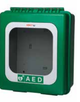
ARKY outdoor cabinet vertical