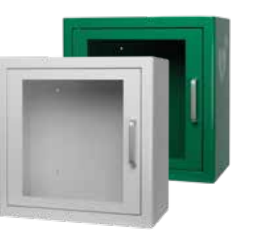
ARKY white and green indoor cabinet