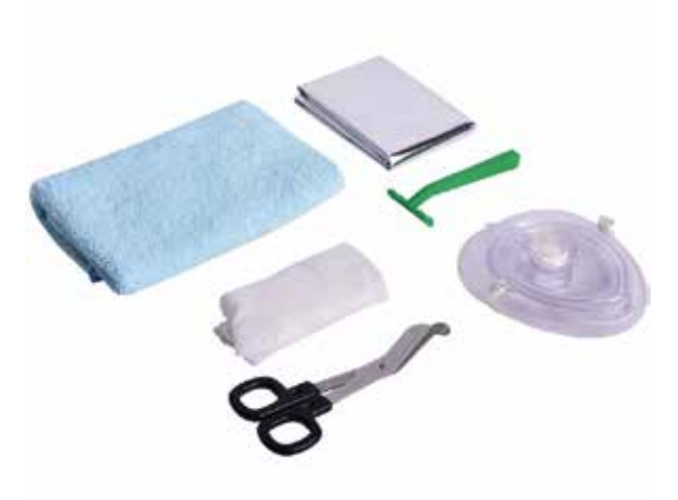
Content of ARKY Safeset