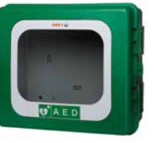
ARKY outdoor cabinet horizontal